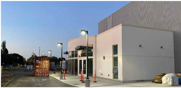
Building exterior at south lobby for music recital hall