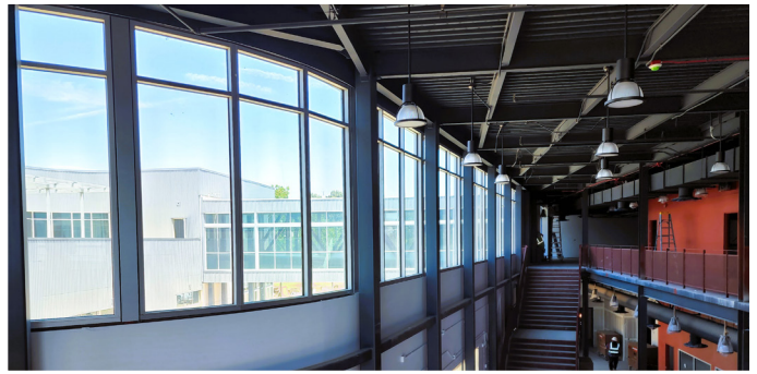
Courtyard windows at second floor south